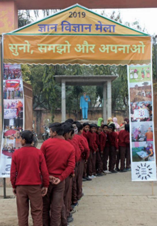
School Boys visiting to the Mela