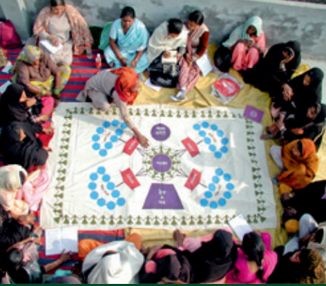
Sabla Samiti Federation of SHGs 2000 members