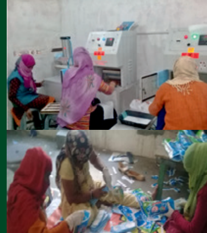
Sanitary pad unit