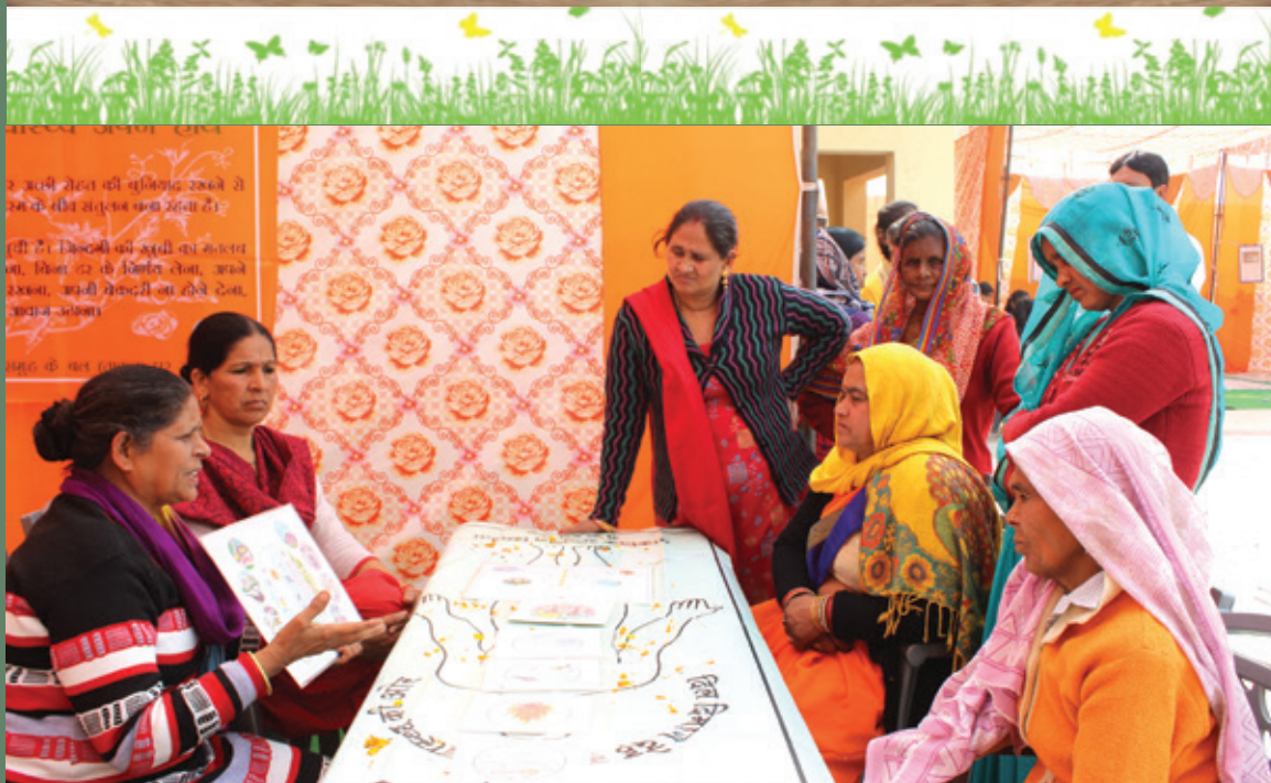
Health workers speak to women farmers